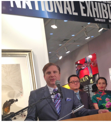
Honoring Chinese artists at opening night of the LA Art Show.